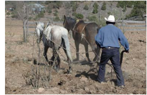
Rarámuri (Tarahumara) farmer guiding horse-drawn plow, Sierra Tarahumara, Chihuahua, Mexico.