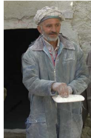
Badakhshani miller of stone-ground flour at water mill on Afghanistan-Tajikistan border.