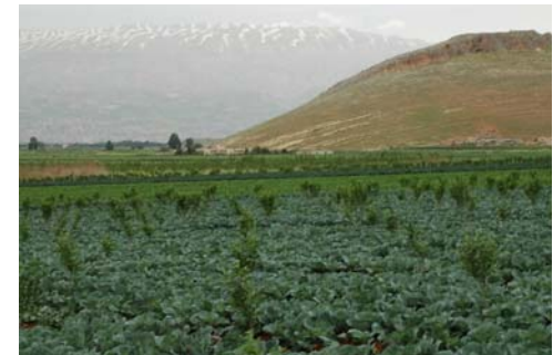
Fields of cabbages intermixed with pasturelands of Bekaa Valley, beneath Mount Lebanon, in the southern cusp of the Fertile Crescent.