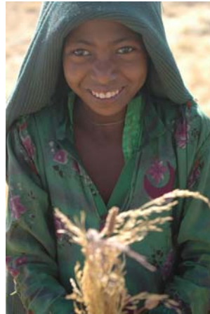
Amharic-speaking girl presenting recently harvested teff, highland Ethiopia.