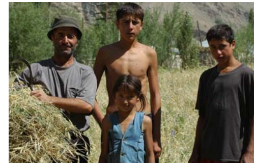
Shugni-speaking father and children harvesting grain in Gunt Valley of the Pamirs, Gorno-Badakhshan autonomous province of Tajikistan.