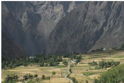
High elevation farming landscape in Khuf Valley of the Pamirs, Gorno-Badakhshan, Tajikistan.