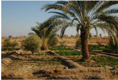
Spring-fed oasis garden of Abou Shrouf, showing multiple strata of planting "hods" in waffle gardens of Siwa.