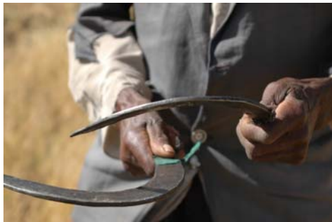
Blind Amharic-speaking farmer harvesting teff, highland Ethiopia: instruments of the harvest.